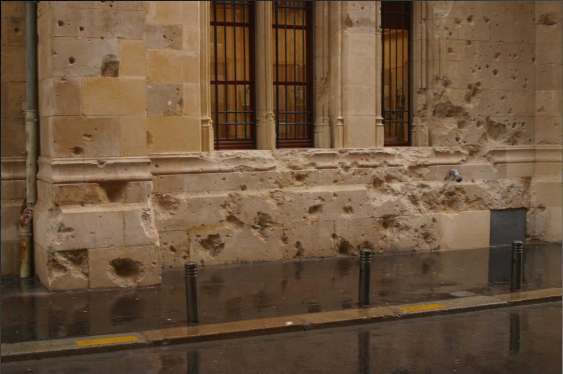
Rouen – Shell & Bullet Reminders