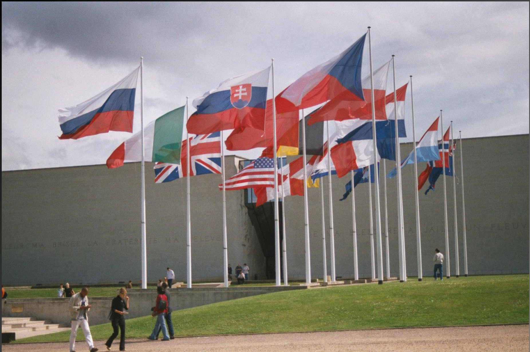
Caen , Peace Memorial