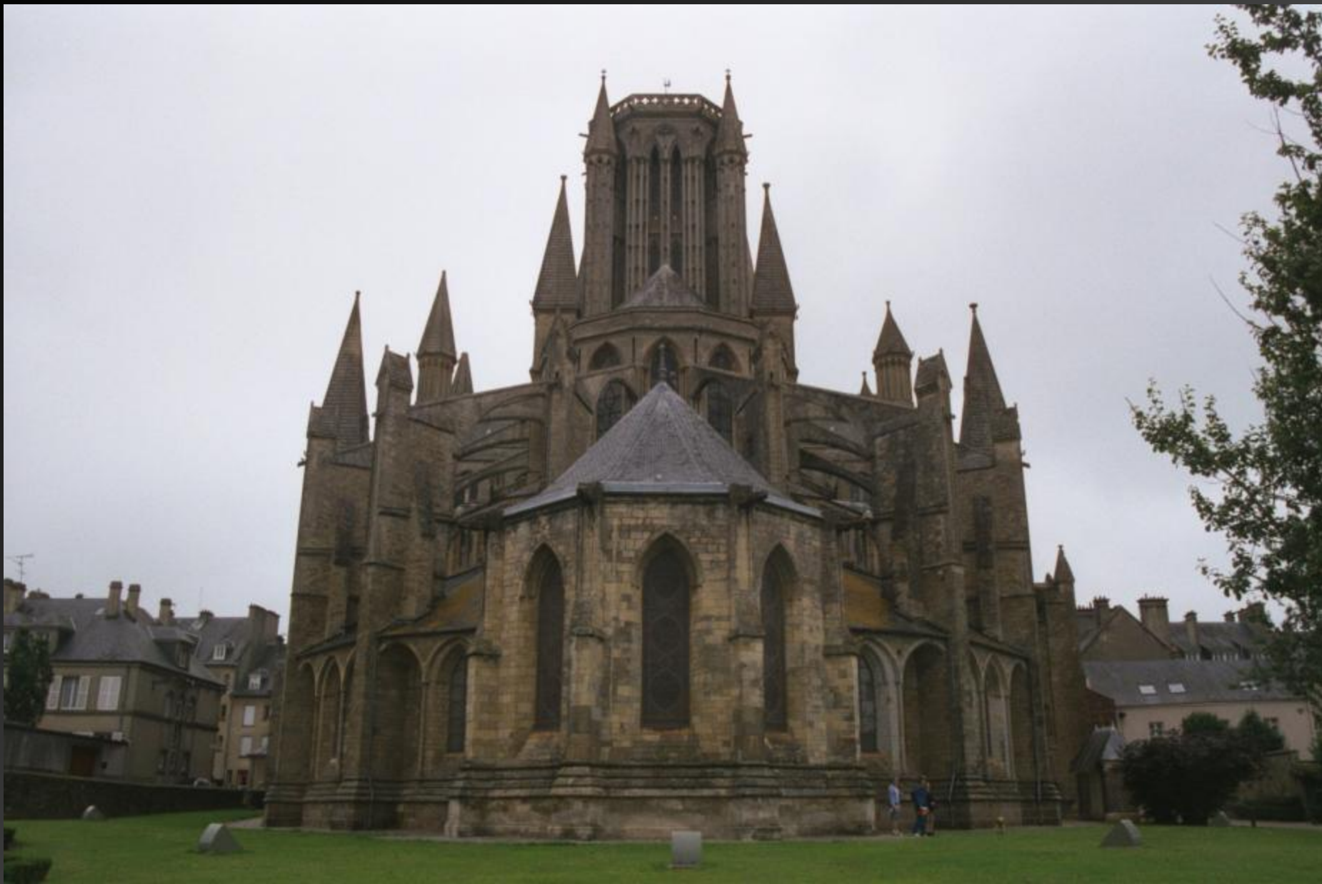
Coutances - Cathédrale de Notre Dame