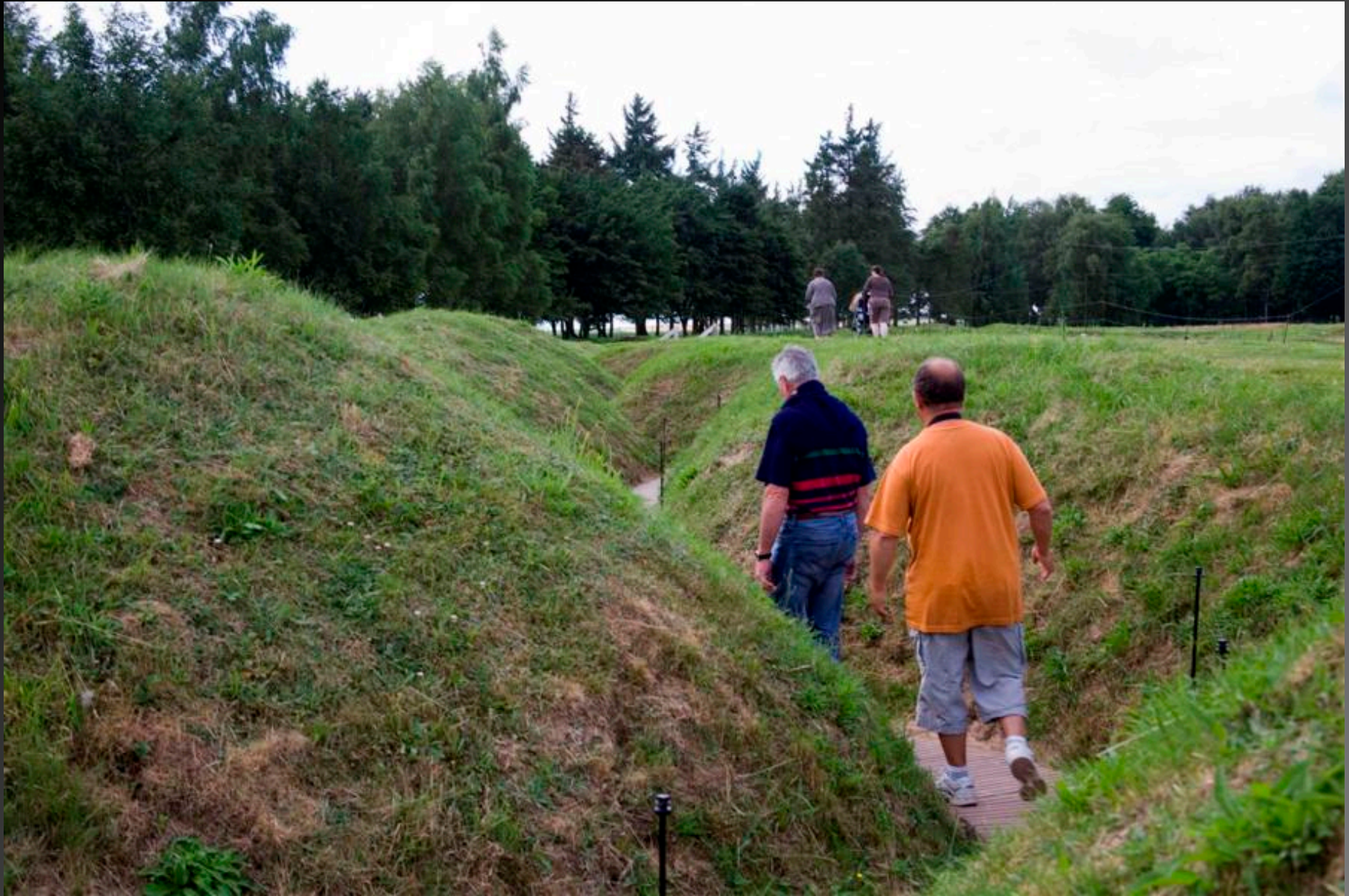
Opened on 7 th June 1925 by Field Marshal Earl Haig