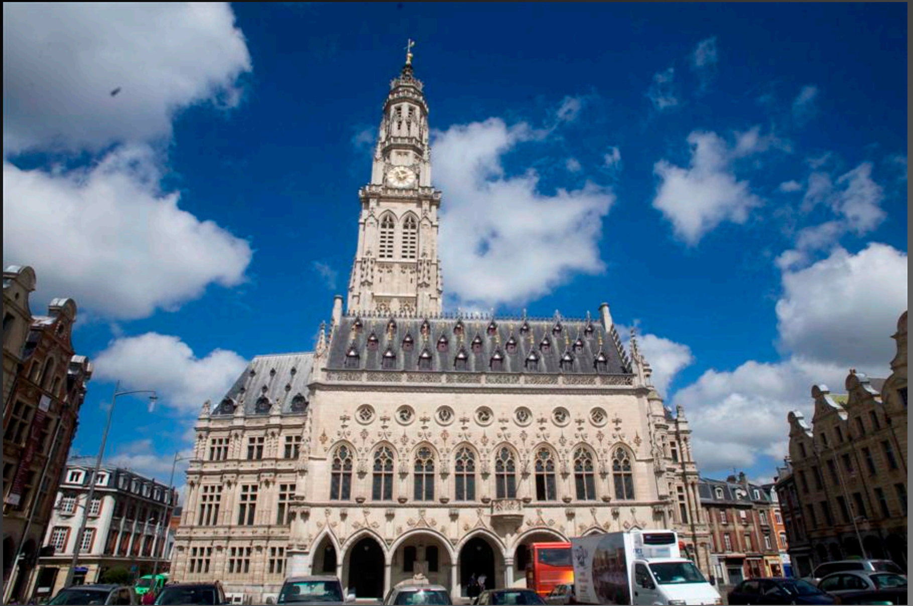
Arras – Hotel de Ville