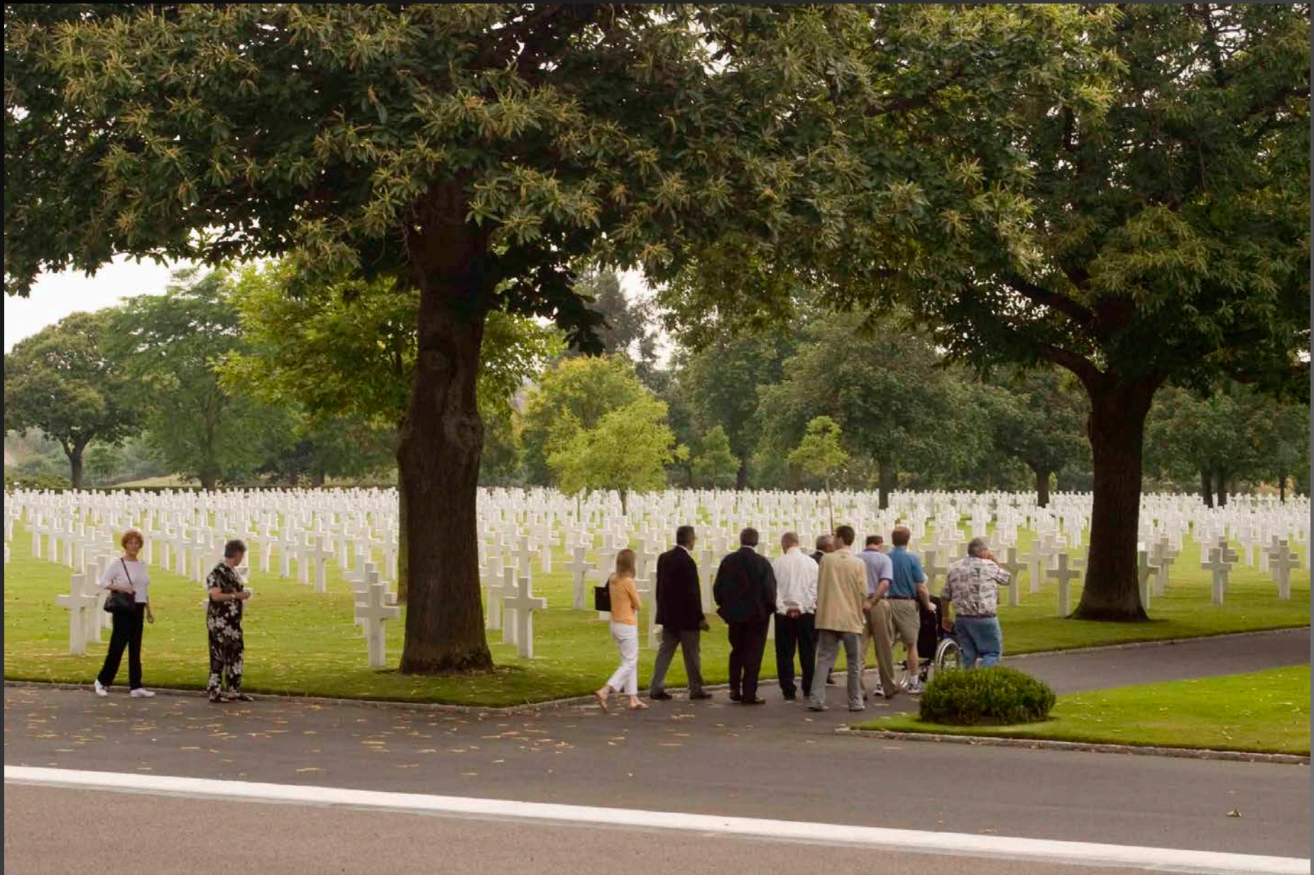
US Cemetery – Searching for a long-lost relative