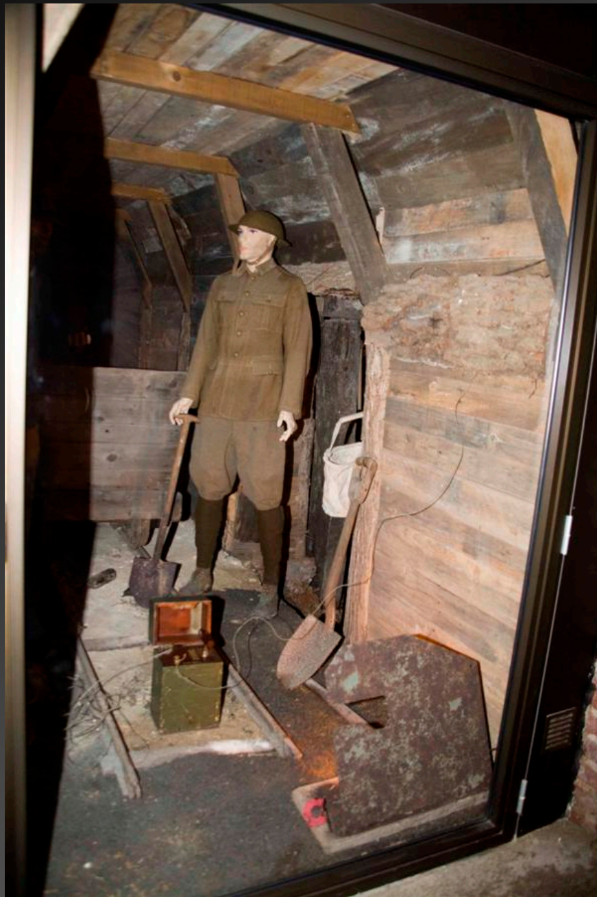
British tunnellers preparing the charge