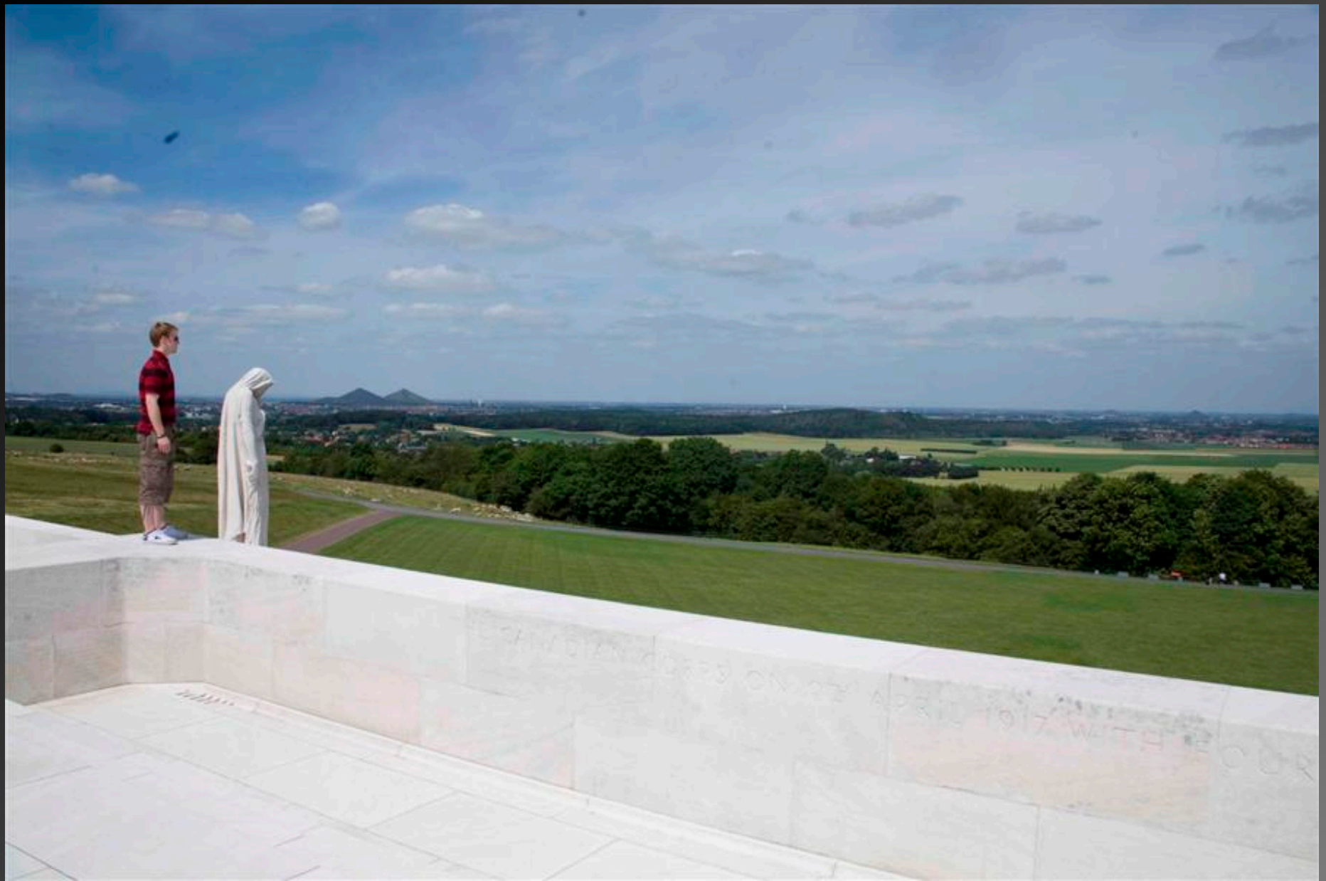
The Double Crassier slag heaps at Loos-en-Gohelle can be seen on the horizon