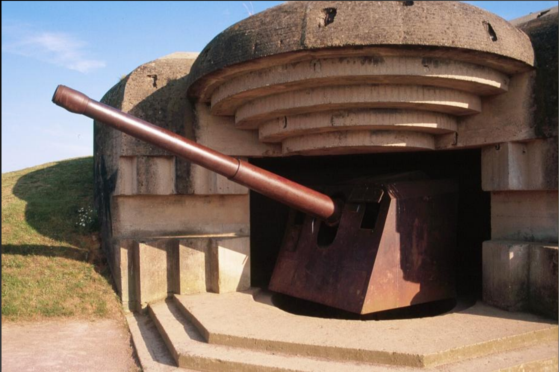
Normandy Landings – Longus-Sur-Mer Observation Bunker