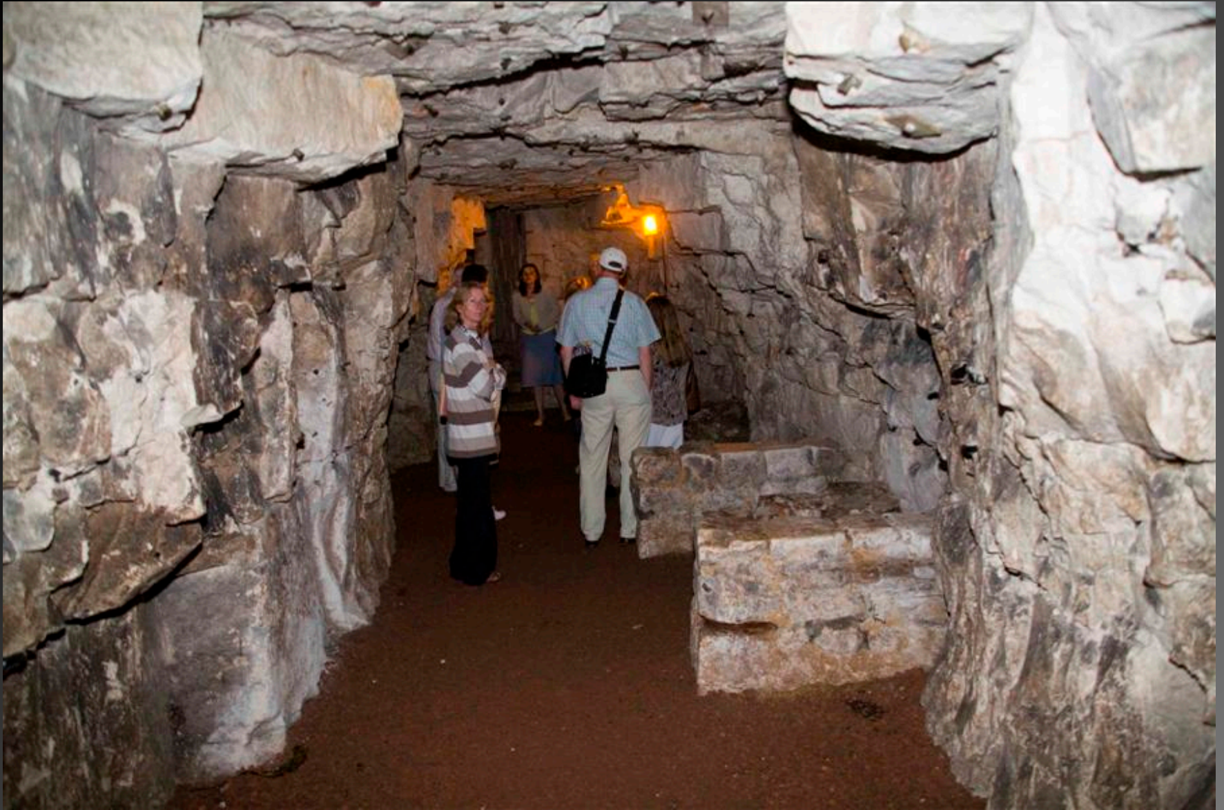
Arras – Les Boves