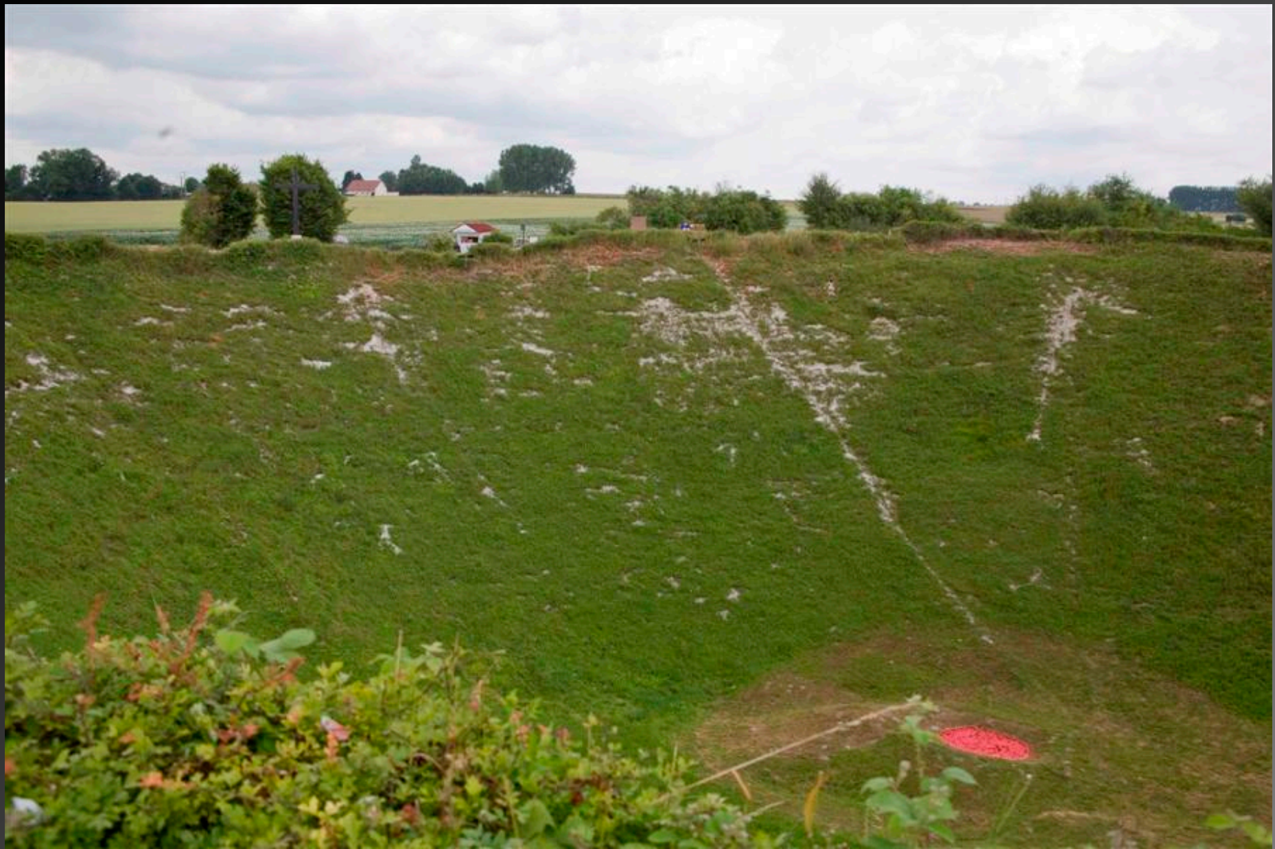
2 soccer pitches, 6 double deckers deep