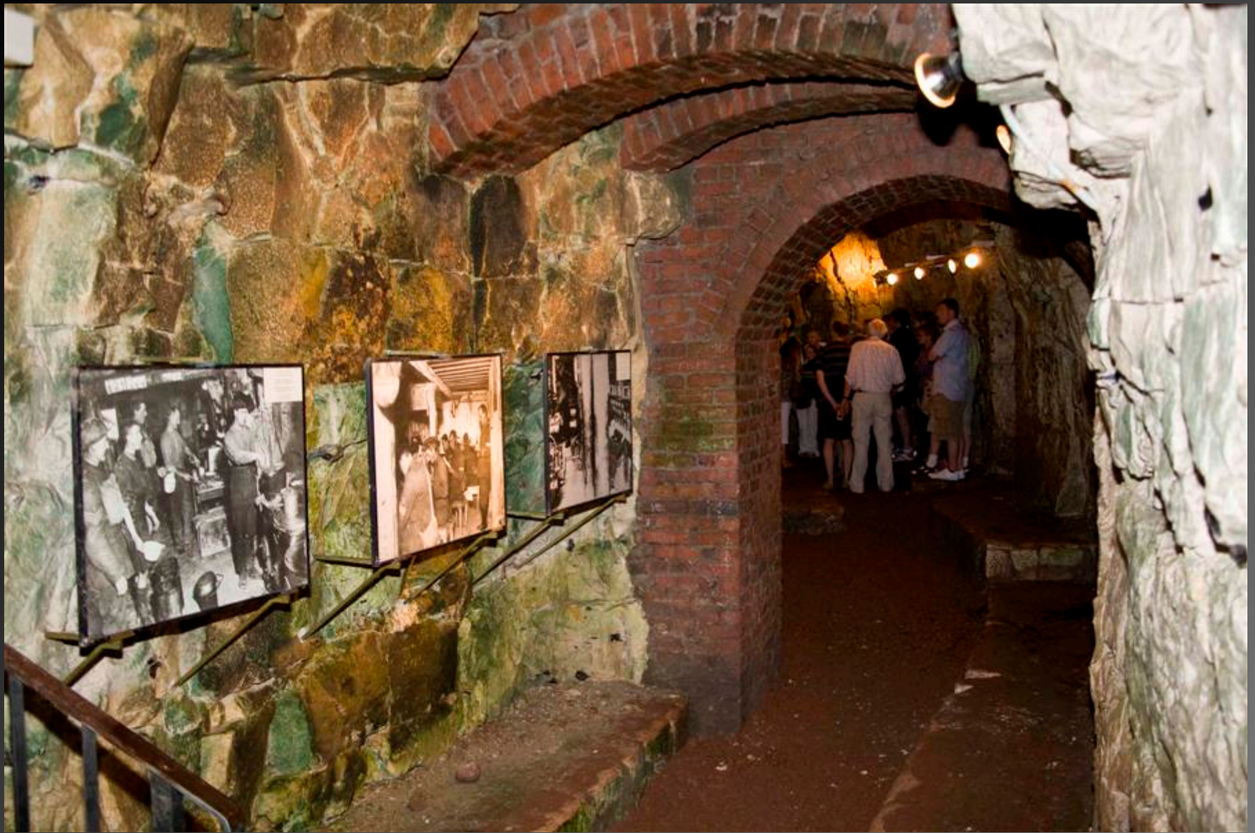
Les Boves – photo gallery showing WW1 occupation