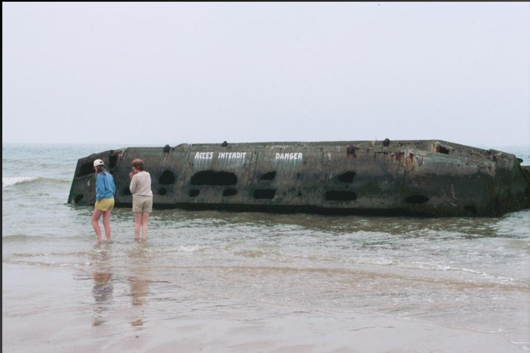
Normandy Landings – Around Arromanches