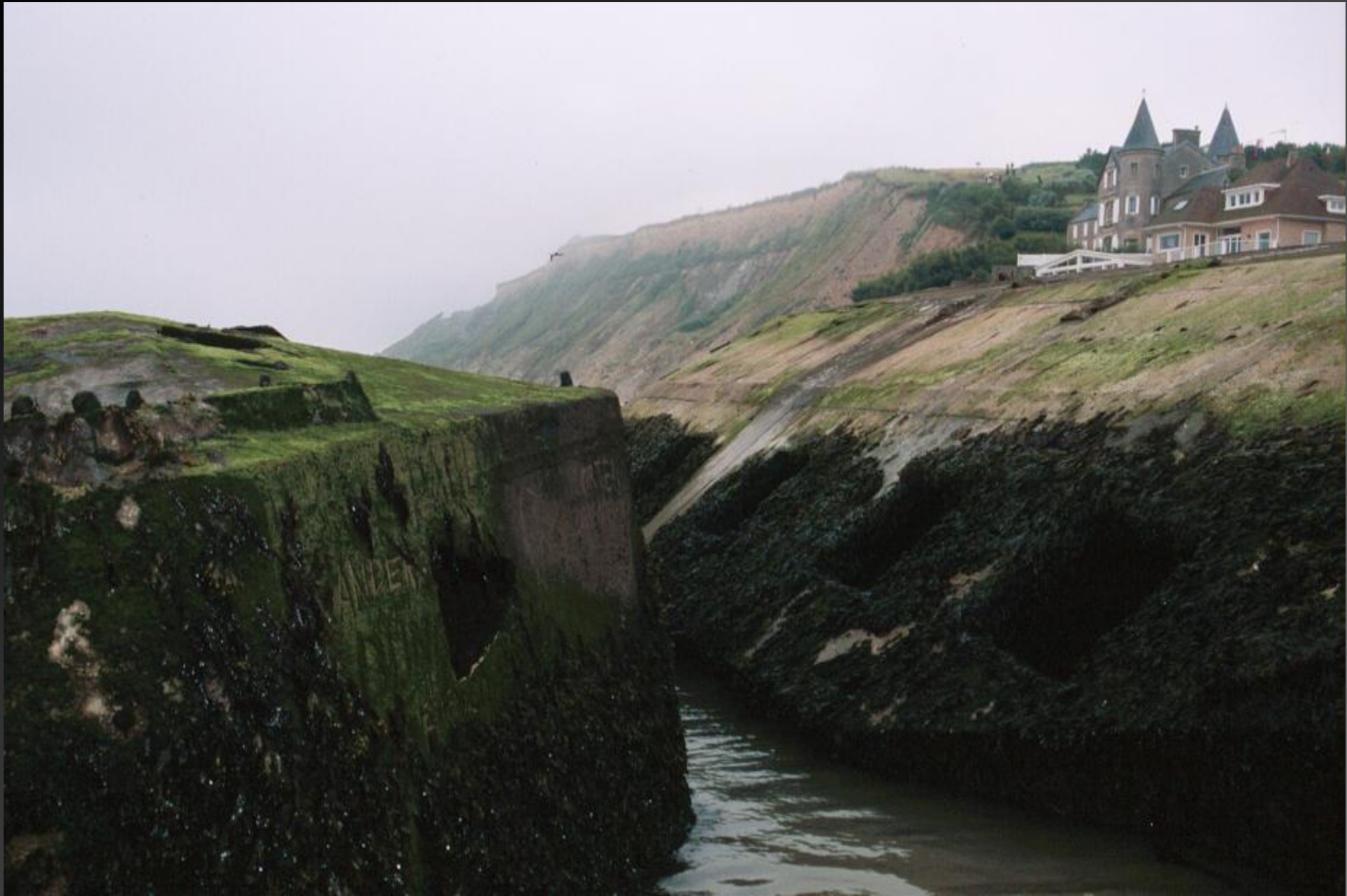
Normandy Landings – Around Arromanches