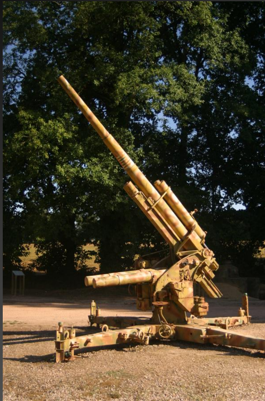
Musee de Resistance