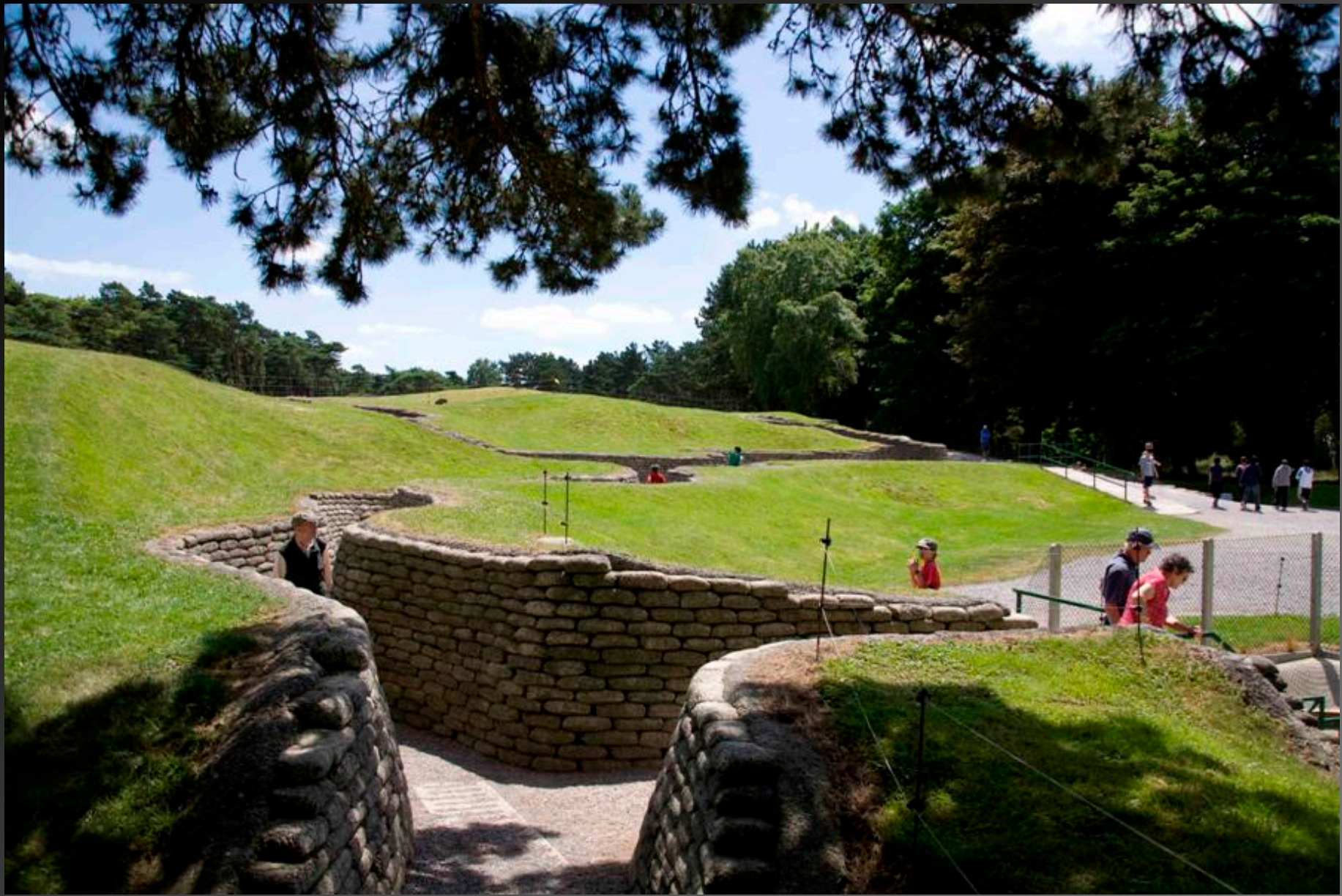
During construction some trenches collapsed due to weather damage...