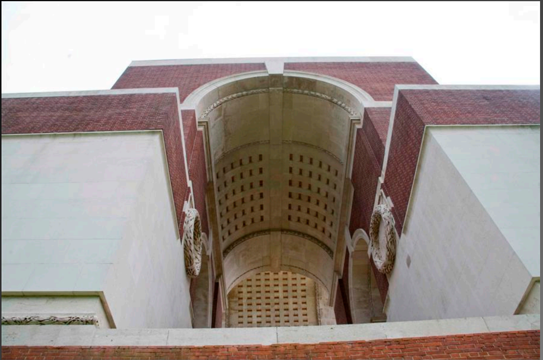
Designed by Sir Edwin Lutyens