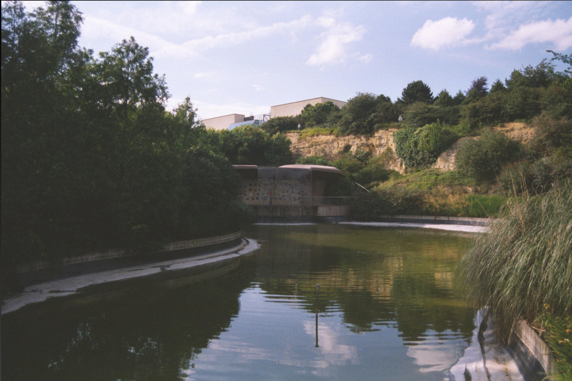
Caen , Peace Memorial