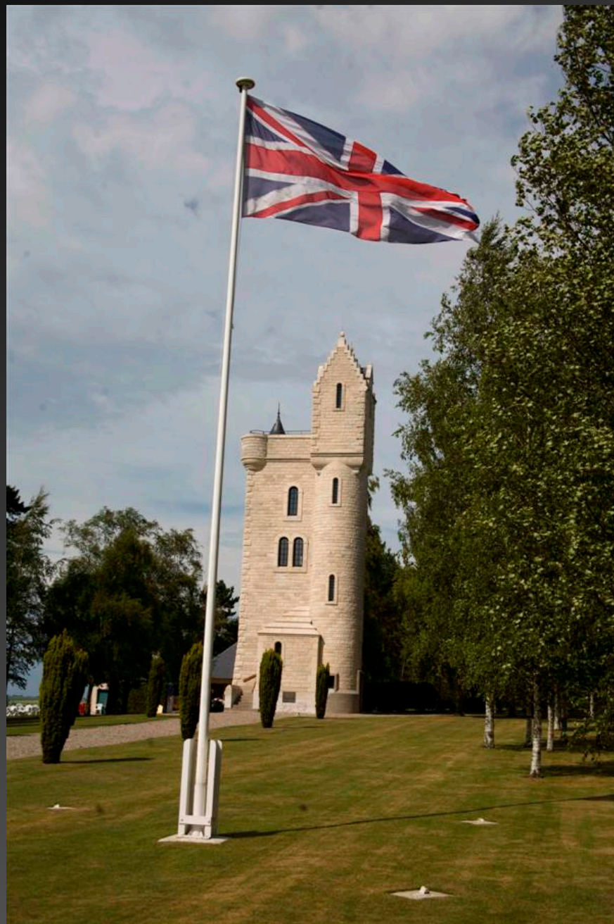
Thiepval – Ulster Defence Memorial