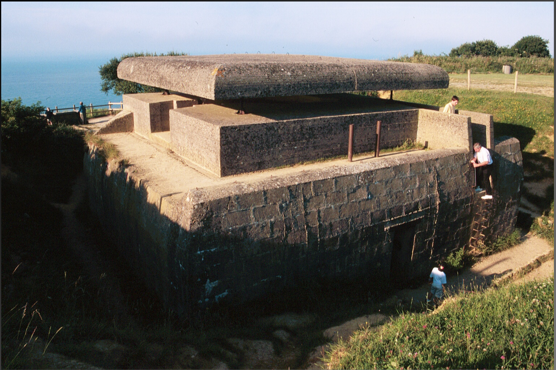
Normandy Landings – Longus-Sur-Mer Observation Bunker