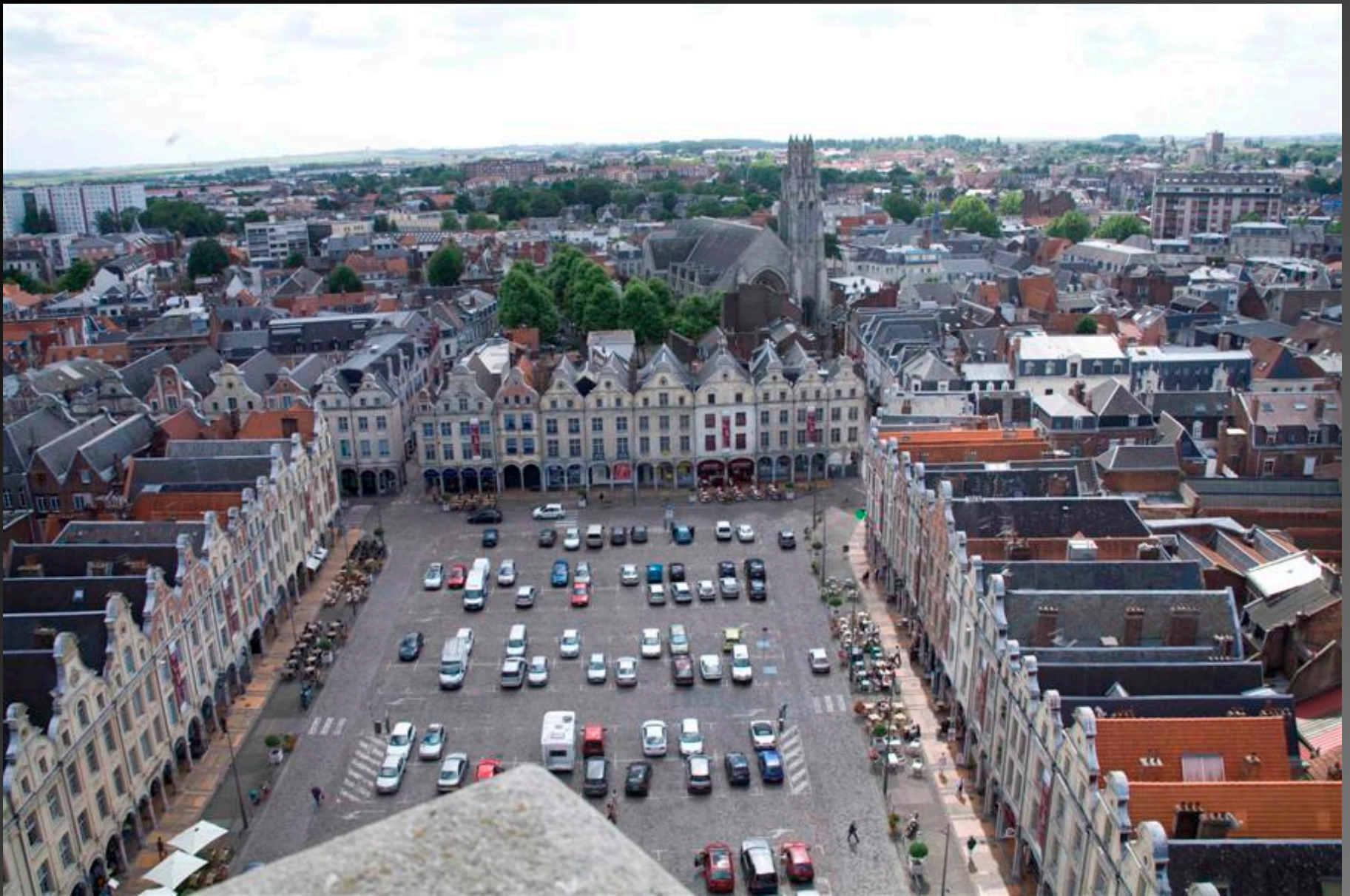
Arras – La Place des Héros