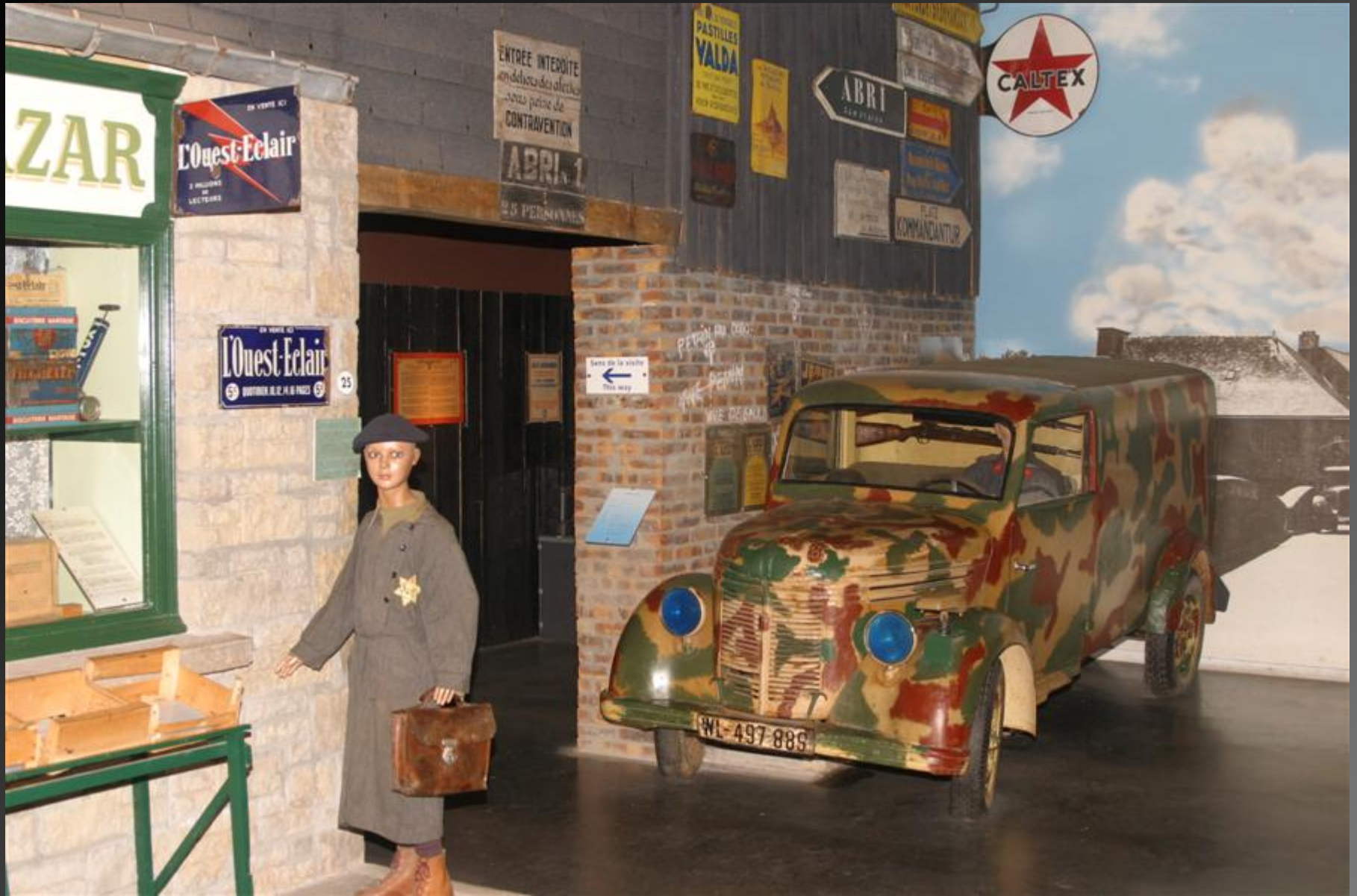
Musee de Resistance