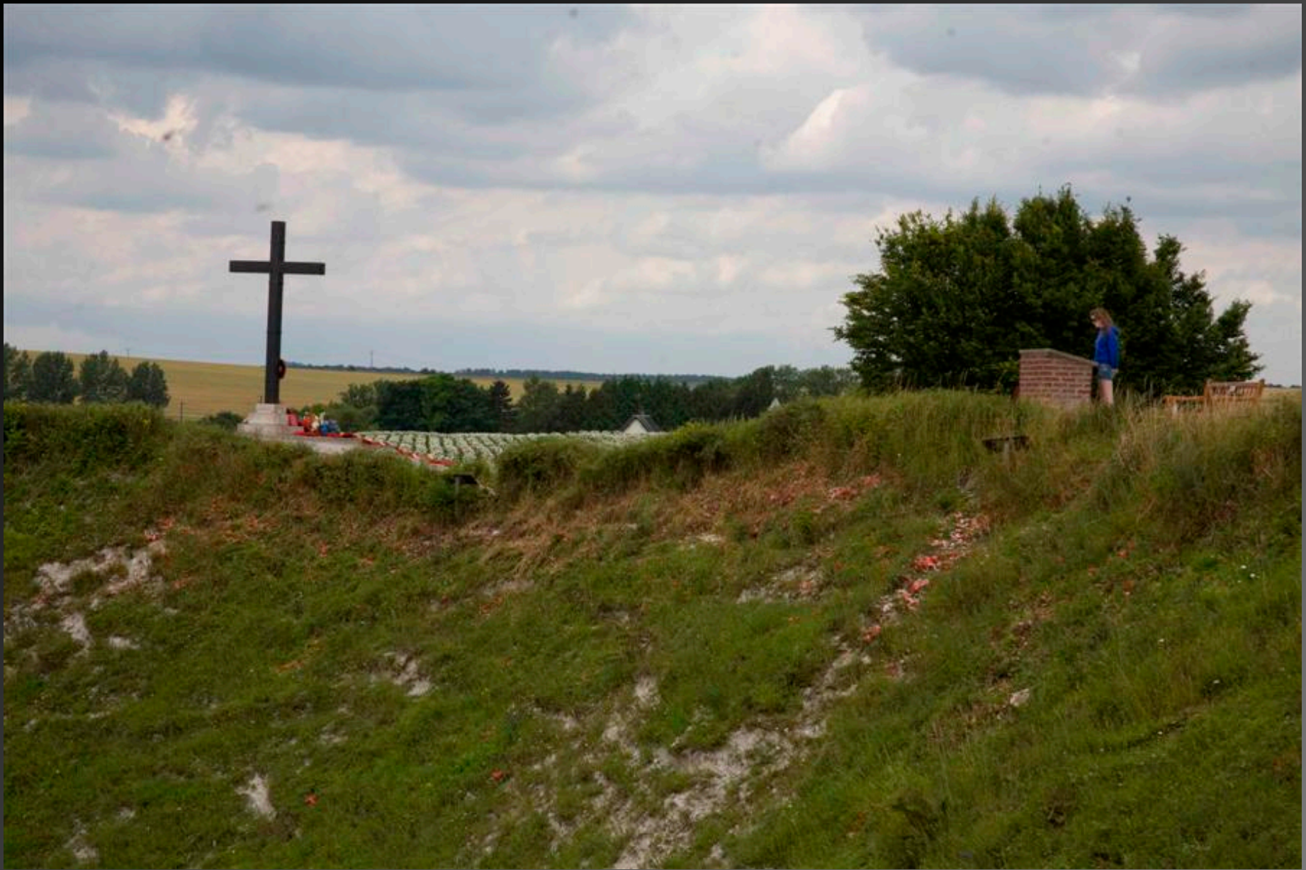
Wooden cross erected in 1986 made from beams removed from the roof of a deconsecrated church near Durham...